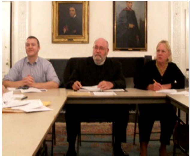
The Rector, flanked by the Wardens, prepares for the most recent meeting to begin.

The Vestry generally meets on the third Wednesday of each month at 7 p.m. in the Parish Hall. Meetings are open to the parish and parishioners are welcome, in advance of the meeting, to request time to address Vestry.